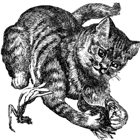
Cats cause tremendous bird mortality.

Cats. Many citizens would be surprised to learn that domestic and feral cats may kill hundreds of millions of songbirds and other avian species each year. A recent study in Wisconsin estimated that in that state