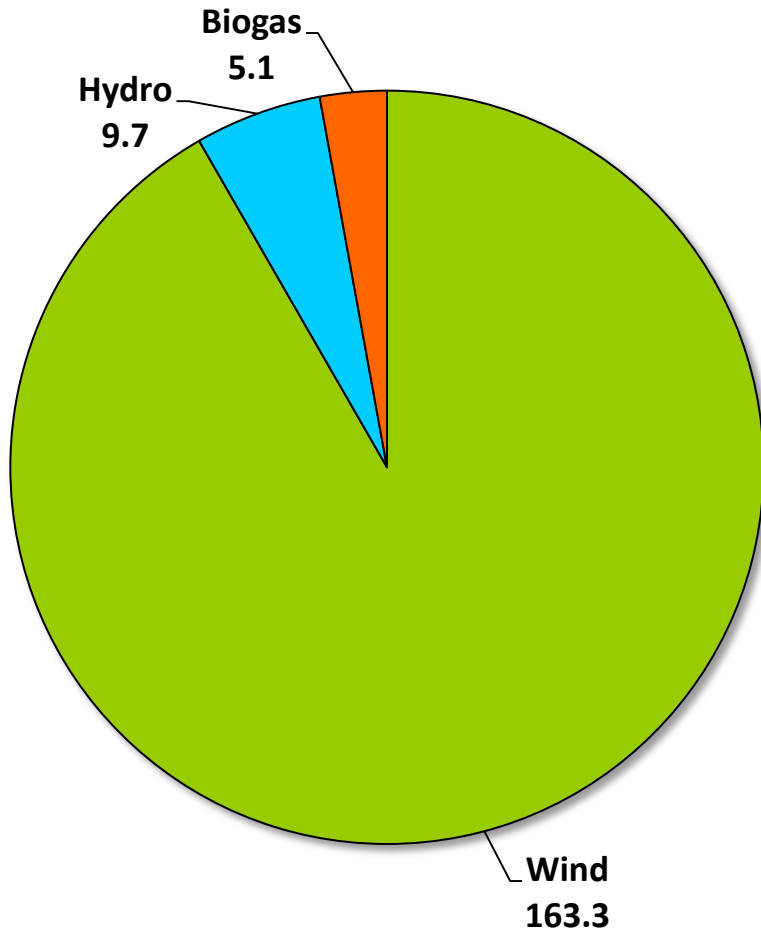
By Capacity (MW)